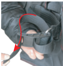
Fig. 12 9